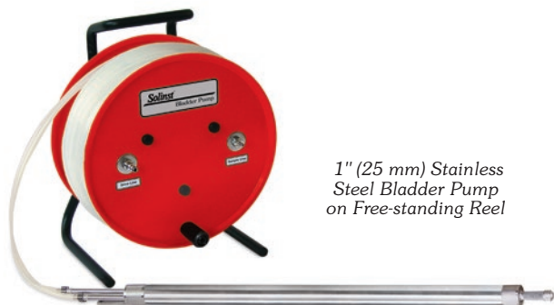
1" (25 mm) Stainless Steel Bladder Pump on Free-standing Reel

They are supplied on a free-standing reel. The rugged systems are very convenient and easy to transport. Tubing fittings on the reels and controller are compression fittings, allowing quick set up in the field. The Solinst Model 103 Tag Line can be used to lower and support the pump in the well (see Model 103 Data Sheet).