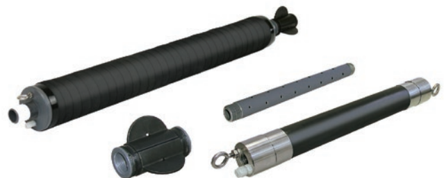
Model 800 Packers 3.9" and 1.8" (99 mm and 46 mm)

Model 800 Low-Pressure Packers can be used with Solinst Bladder Pumps to minimize purge times by reducing purge volumes. This reduces the cost of water disposal and labour. Packers are available in single point or straddle packer designs, and in sizes to fit 2" (50 mm) to 5" (127 mm) dia. wells. (See Model 800 Data Sheet.)