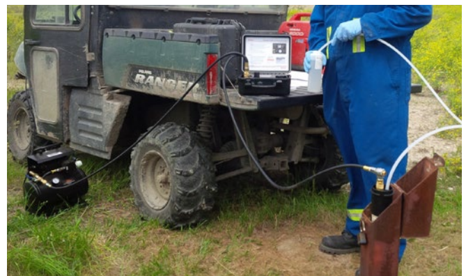
Sampling with a Dedicated Bladder Pump using Portable, Rugged, Easy-to-use, Compressor and Controller

For water level monitoring there is an access hole to fit a Solinst Model 101 Water Level Meter or Levellogger. An eyebolt is provided for a pump support cable or for suspension of a Solinst Levellogger, (see Model 3001 Data Sheet) or other device.