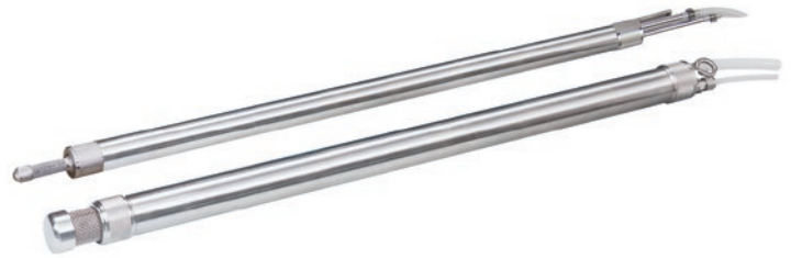
Solinst Bladder Pumps available in Stainless Steel 1" and 1.66" (25 mm and 42 mm).