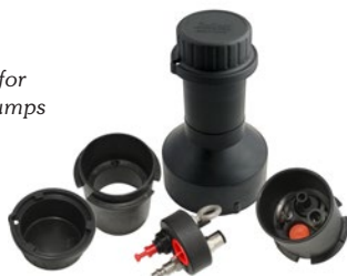
Well Caps for Dedicated Pumps

The caps slip easily onto 2" dia. (50 mm) wells. Adaptors to fit 4" dia. (100 mm) wells are also available. They have quick-connect fittings for the drive and sample tubing.