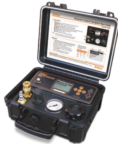
Model 464 Electronic Control Unit (125 psi and 250 psi Models)

These convenient Controllers are rugged, dependable and suitable for all environments. Quick-connect fittings allow instant attachment to dedicated well caps, portable reel units and to an air compressor or compressed gas source.