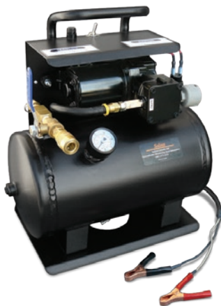
12 Volt Compressor

The compressor operates using 12 volt DC power source, such as a car or truck vehicle battery, and comes with alligator clips. The compressor operates at up to 125 psi and is equipped with a 2 US gallon (7.6 L) air tank which is rated to 150 psi.