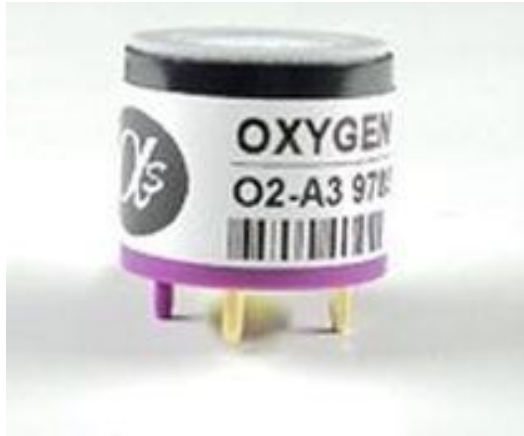
Electrochemical oxygen sensor / long-lifeA series