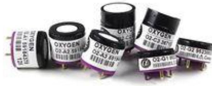
Electrochemical oxygen sensor