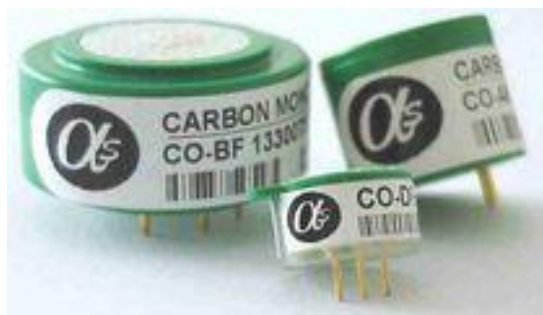
Electrochemical carbon monoxide (CO) sensor