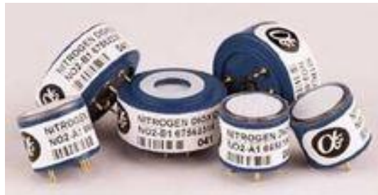
Electrochemical nitrogen dioxide (NO2) sensor