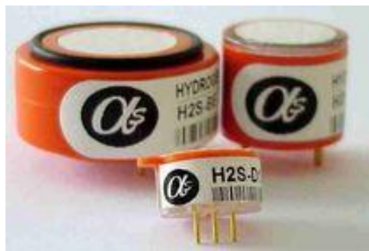
Electrochemical hydrogen sulfide (H2S) sensor