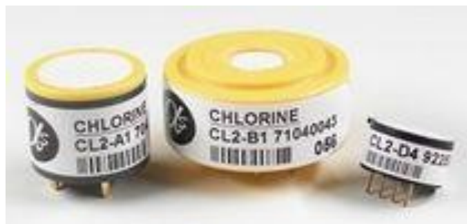
Electrochemical chlorine (Cl 2 ) sensor