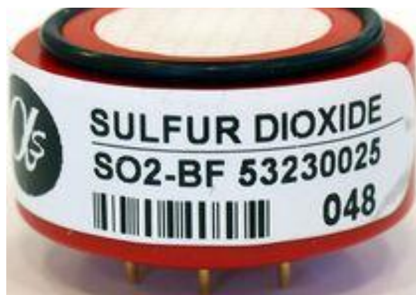
Electrochemical sulfur dioxide (SO 2 ) sensor