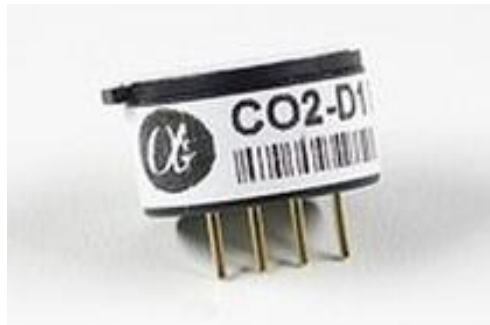
Solid-state carbon dioxide (CO 2 ) sensor