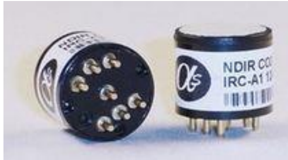
NDIR carbon dioxide (CO 2 ) sensor 0 - 5 000 ppm | NDIR