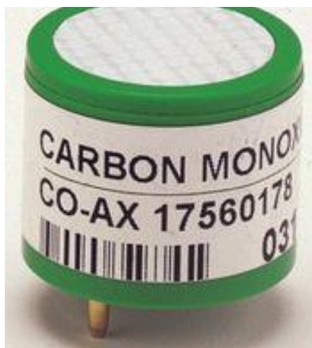
Electrochemical carbon monoxide (CO) sensor with low hydrogen cross sensitivityA series