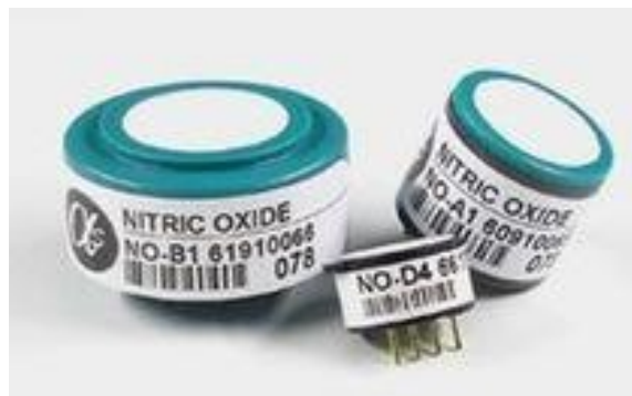
Electrochemical nitrogen monoxide (NO) sensor