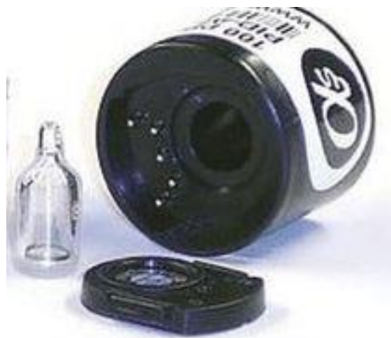
Photoionization gas sensor 50 ppb - 6000 ppm