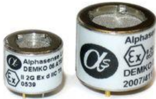
Catalytic flammable gas sensor ATEX, IECEx, UL, CSA