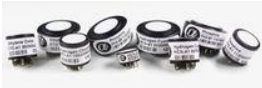
Electrochemical toxic gas sensor C 2 H 4 O, HCl, HBr, HCN, PH 3 , NH 3 ,