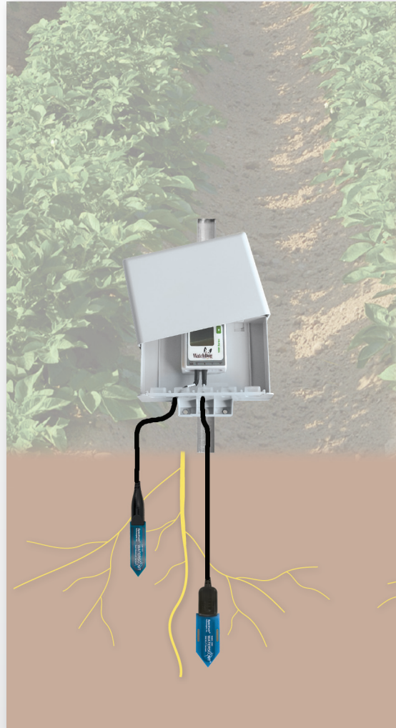
WatchDog 1000 Series Micro Station shown with one WaterScout SM 100 Sensor and one SMEC 300 sensor.

You can collect data and log results when the WaterScout SMEC 300 Sensor is connected to a WatchDog Station.